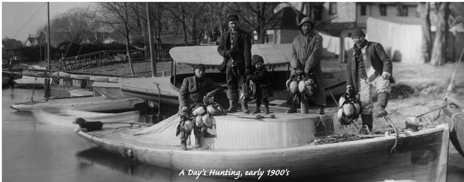
A Day's Hunting, early 1900's